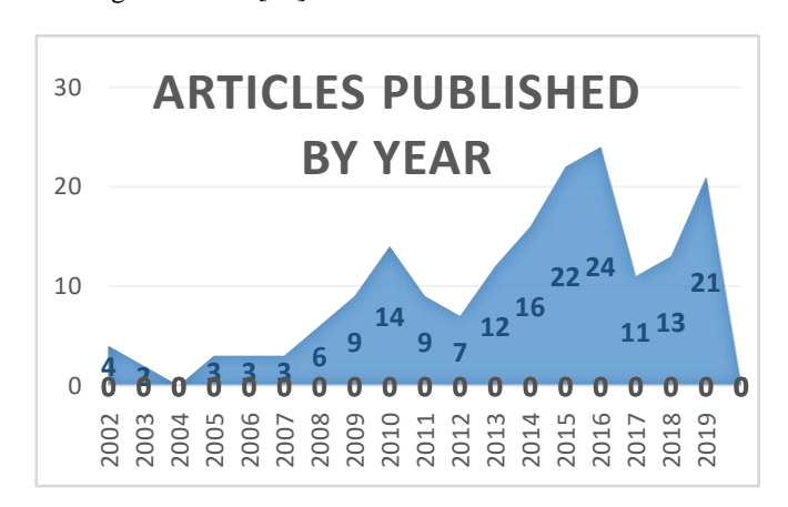
Figure 2.Distribution of the published articles

Moreover, Figure 2 shows the distribution of articles based on the date published. The date starts from 2002 until 2019. The reason for selecting 2002, which is the date after the announcement of Agile manifesto in 2001. According to Figure 2, the number of articles conducted on this topic started to increase due to the increase in attention to ASD. However, the Agile RE still ambiguous for practitioners, even though there were several articles conducted on RE in agile context [17].