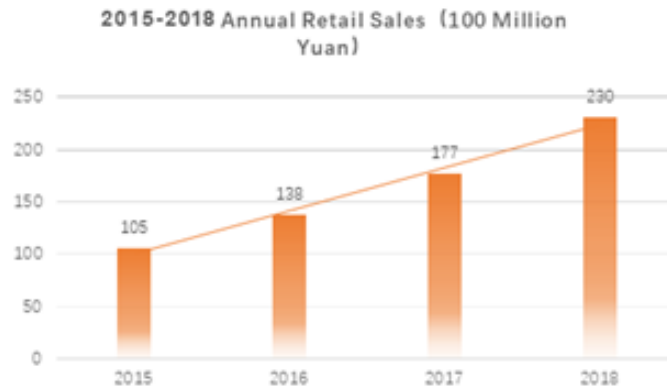
Figure 2. 2015-2018 Annual Retail Sales (100 million yuan)

In this paper, we focus on the rebirth strategy of Pechoin against the backdrop of new media. This paper analyzes the brand's innovation and marketing strategy before summarizing its current shortcomings and improvement measures. We hope that our findings could promote the rebranding and revitalization of other well-established brands to help them achieve sustainable development.