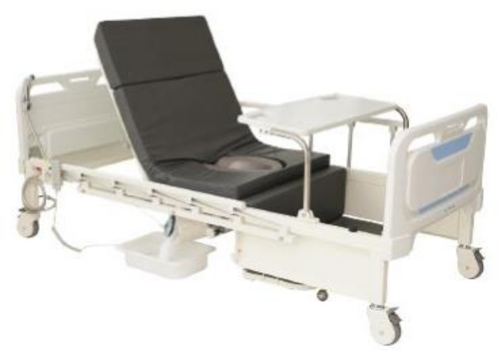
Figure 1. Toilet-incorporated electric medical bed

The international standard applicable to the electric medical bed for patient use is IEC 60601-2-52:2009 [8]. In Korea, the standard for electric medical beds is included in medical equipment standards, Notification 2018-72 by the Ministry of Food and Drug Safety [9].