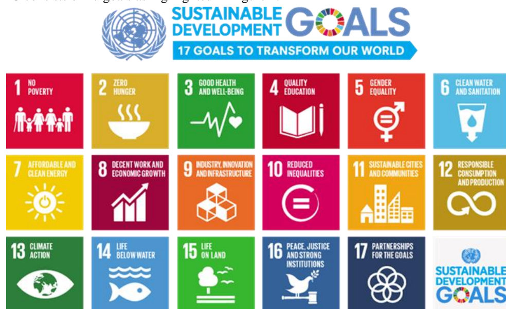
Figure 1: UN's Sustainable Development Goals.

The United Nations then defines a more holistic characterisation of sustainable development, which includes social, economic and environmental factors [1]. This description applies to all the UN's long-term plan and goals such as the Millennium Development Goals (MDG) and the Sustainable Development Goals (SDG). After the worldwide success of the MDGs, the UN member states unanimously agreed to adopt and implement the post-2015 development agenda on the 2nd of August 2015 [1]. The new, more comprehensive planned agenda is an action strategy for the planet itself, for the people living on it and for the prosperity of those people, and it is called the SDG. The SDG consists of 17 goals as highlighted in Figure 1.