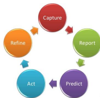
Fig.3 Learning Analytics Phases

Learning analytics is an effective digital tool in personalized teaching. It is beneficial in teaching and learning process. It is the collection of learners and teaching and learning methods for the improvement of education field. Students, instructors, departments and advisors are important entities. It will change the traditional ways and will improve the performance of the student and teacher. It will help for data driven decision making and strategic planning. There are different phases of learning analytics. Based on requirements data is collected. Data will be provided for decision making and relevant predictions will be done. Proper action will be taken. If necessary refinements are done.