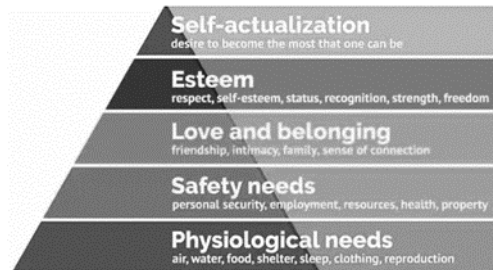
Figure 1: Maslow's hierarchy of needs [7]

At the end of March 2020, Malaysian government has taken public health and social measures by implementing MCO that affected immediately without any early notice. The purpose of the action was to slow or stop the spread of Covid-19 disease at national or community level. According to New Straits Time online newspaper [6], all the public and private higher education institution in the country were ordered to close in response to the Covid-19 pandemic in Malaysia. During the MCO period, the university students were prohibited from leaving their respective residential colleges and all their welfare were managed by their own residential college. Referring to Maslow's hierarchy of needs [7] as in Figure 1, the needs of lower level have to be satisfied before individuals can attend to the higher level needs.