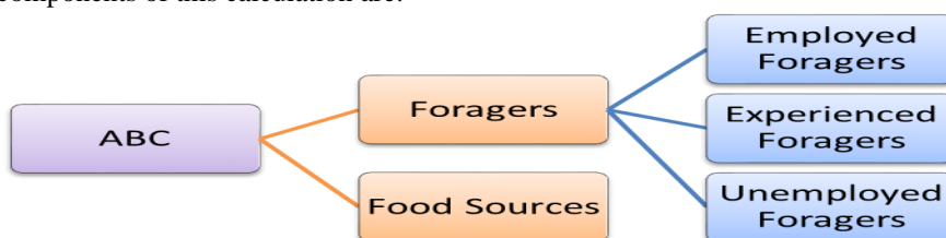
Figure 1 Elements of ABC algorithm

Counterfeit honey bee state territory or artificial bee colony (ABC) calculation is propelled by the keen conduct of bumble bees and it was created by Dervis karaboga in the time of 2005. This is a streamlining procedure that mimics the maturing conduct of bumble bees which is effectively applied in different empirical issues on earth. For the enhancement of numerical test works, this calculation can be effortlessly utilized [16]. The significant components of this calculation are: