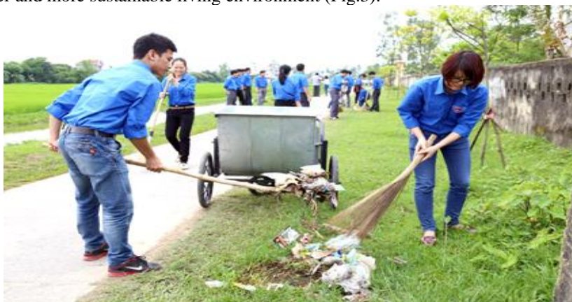
Fig.3. Activities to protect the environment of local people

There are environmental protection programs taking place in many places in Vietnam. Not only young Vietnamese participate in this activity, but also foreign tourists and children with their parents engaged in activities such as cleaning the streets, canals and rivers [4]. Many young people have gathered a sense of environmental protection for themselves and this will be the first step for each individual's environmental awareness change in Vietnam, changing habits for the better, starting small actions in everyday life such as putting garbage in the right place, learning how to keep their places green. etc. Especially, with the future generations of the country, they need to aim for a healthier and more sustainable living environment (Fig.3).