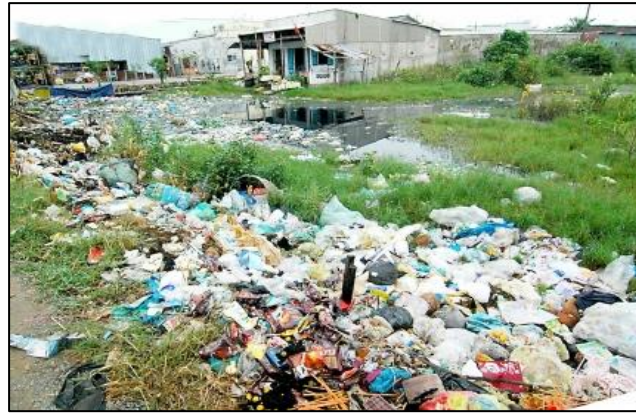
Fig.1. The status of water pollution in Mekong delta

According to the annual monitoring results of the Department of Natural Resources and Environment of Tien Giang-Ben Tre province, the water source of the Mekong River is seriously polluted, especially the area near the city center and near industrial zones. In particular, something such as oil, iron, microorganisms, etc. exceeded the environmental standards [5]. If there is no solution to this problem, it will be even worse and harm human health [3]. And one of those influences is the tourism sector. The tourism industry is significantly affected when the environment is not fresh, when the environment is polluted. The current situation of water pollution on Mekong River from the discharge in industrial zones and some people living along the river is alarming the environment.