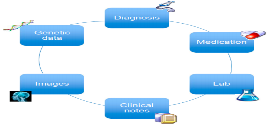
Figure 1: different health data sources

Benefits of an electronic health record include a gain in healthcare efficiencies, large gains in quality and safety. Also, it lowers healthcare costs for consumers. Especially, that we have different healthcare resources are availableas shown in the nextfigure: