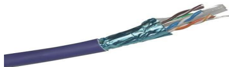
Figure 2. shows the connection cable

It is a copper wire consisting of four twisted and sheathed pairs which are usually armored to increase their protection, working to connect computers with each other to form a network [16].