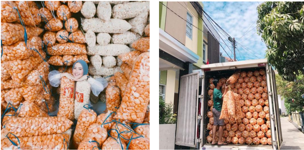
Figure 1: Dorokdokcu business documentation

itself is a typical West Javanese skin cracker food that is packaged in the size of a bolster. Ucu started his business with no background, but Ucu took risks to develop his skills in that field.