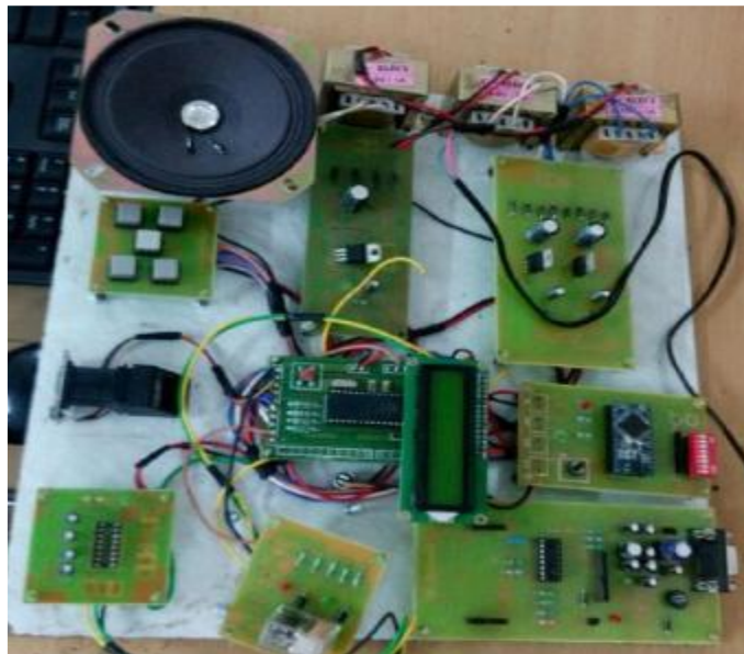
Figure.2. Prototype Attendance Monitoring System

Outside both of the two glass plates, one polariser is pasted. The light rays going through these polarisers will be rotated to a certain angle and in a certain direction. When the LCD is turned off, light rays are rotated by the two polarisers and the liquid crystal, resulting in light rays exiting the LCD with no orientation, giving the LCD a translucent appearance. The liquid crystal molecules would converge in a certain direction if enough voltage was added to the electrodes. The polarisers will spin the light rays going through the LCD, causing the appropriate characters to be enabled or highlighted. The LCDs are thin and compact, measuring just a few millimeters wide. LCDs are compatible with low-power electrical circuits which can be operated for long periods of time since they use less power. Since LCDs do not produce light, light is required to read the display. Reading in the dark is feasible with the aid of backlighting.