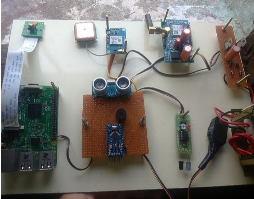
Figure 2. Overall System Setup

The figure 2 showed the overall implementation of the system. The system software, hardware and the functionalities used in this system are described below. The open source Arduino IDE uses C++ based interface to communicate with the Arduino processor. It can be used with any Arduino boards. To upload and debug programs the connection is established between Raspberry Pi and Android studio. The Arduino uno is ATmega328P based microcontroller board which connects to the computer through USB cable to convert power from AC-to-DC adapter. It is also installing all hardware and software components of the model. It is a microcontroller based open platform which has a chip that reads input and produces output for the user given commands. The interface medium Arduino IDE is coupled with a chip for proper communication. The ATmega328 based microcontroller board which has 14 digital input/output pins with onboard resonator, reset button and holes for mounting pin headers. Using this board, a smart hoodie model has developed. The obstacles are detected by Ultrasonic sensor and Raspberry Pi 3 is encapsulating the features of the personal computer system. It can be plugged into TV or with a keyboard depending on the purpose of the work. Using this device one can perform all basic computers.