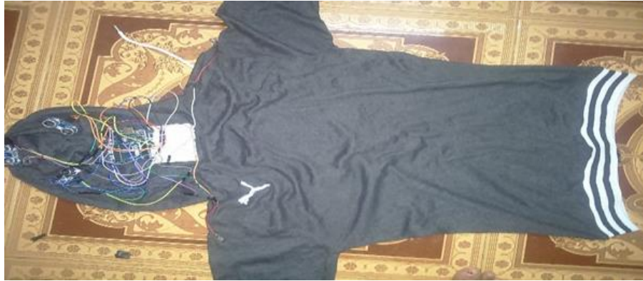
Figure 3: A Smart Hoodie

and GSM/GPRS is attached to communicate with blind users. The buzzer that is moulded in the board helps to notify the impaired user if any uneven or hole detected.