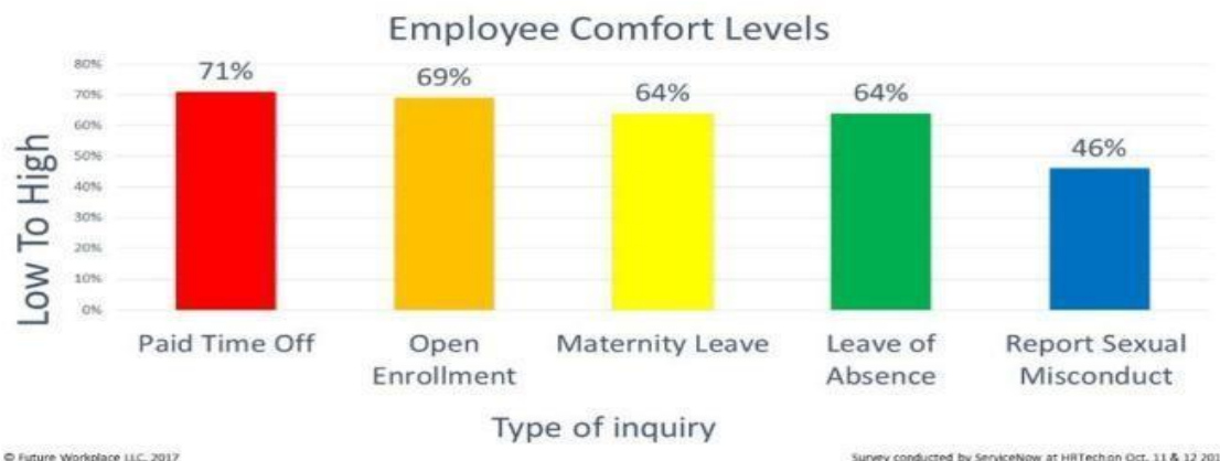
Figure 1 Two-thirds of HR leaders believe employees are very comfortable using chatbots to interact on factual/transactional inquiries