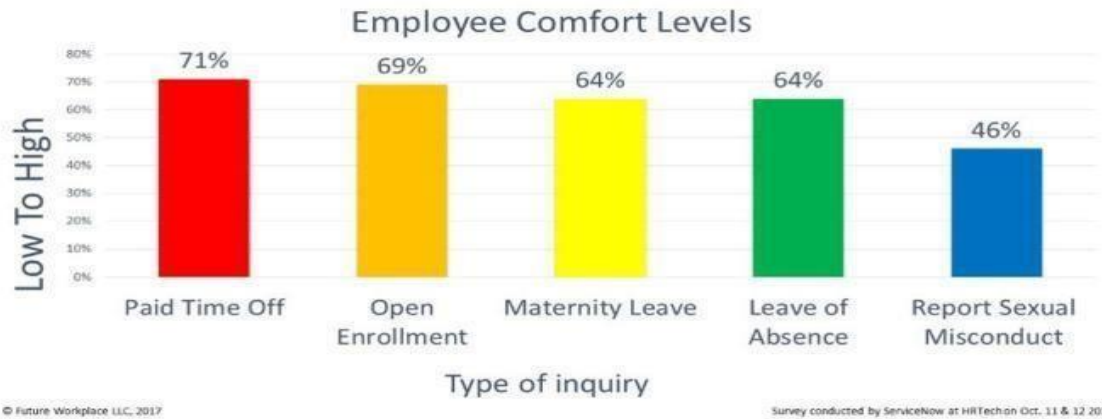
Figure 1 Two-thirds of HR leaders believe employees are very comfortable using chatbots to interact on factual/transactional inquiries