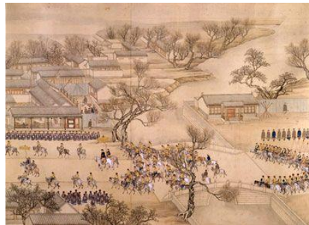
Fig.3 A part of a 〈Picture of a trip to the south with Emperor Qianlong〉.Emperor Qianlongis in the center

The 〈Picture of a trip to the south with Emperor Qianlong(乾隆南巡图)〉 depicts his first visit to the southern part of China in 1751. This is atotal of 154.17m in length to represent the 112 days 5,800ri(里) itinerary. Twelve poems,out of the 520 written during this visit, were depictedin the painting. While there is some uncertaintyabout the exact timing, there are some stories regarding theXiHuLongjingtea.