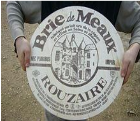
Fig.7 Brie de Meaux

Meaux and Brie de Melun to be sold. Brie de Meaux weighs an average 2.8kg with a diameter of 36 to 37cm. Brie de Melun is slightly smaller, with 1.5 to 1.8kg in weight and is 27cm in diameter.