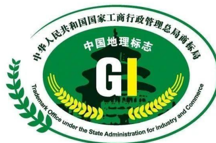
Fig.6 China`s GI certification mark