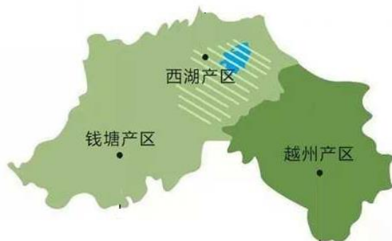
Fig.5 Longjin tea`s main production area

Later, XiHuLongjintea became the best Chinese tea and ranked number one in 1959 among the top ten Chinese teas. Depending on the production area, Longjintea is known as “XiHuLongjin,” “Qiantang Longjin,” and “YuezhouLongjin.” Longjin tea was registered for GI in 2009. The name “Longjintea” can only be used for 18 regions in the Zhejiang province. However, XiHuLongjintea has the best quality among all Longjintea. This shows how a story about a historical figure and the local specialty can lead to fame and brand positioning.