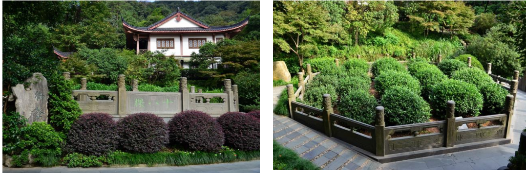
Fig.4 Emperor Qianlong`s 18 tea trees[十八棵御茶]

After the kinglabelled the Longjin tea trees as “royal trees,” their fame spread across China like wildfire. ShēnChū(沈初) wrote in XiQingBiJi (西清筆記) that the best Longjintea leaves are picked before KogU(穀雨). This is known as the head class(頭綱) when picked on CheongMyeong(清明) and is offered to the king. Emperor Qianlong shared the tea with his cabinet members.