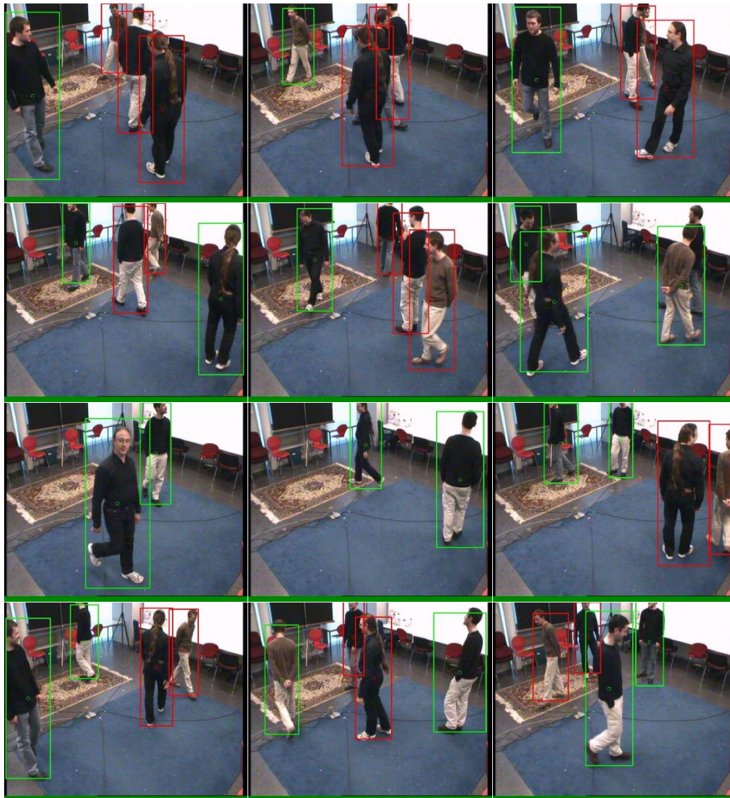
Figure 4. Frames of EPFL video

The position of camera and the distance between persons and camera are different, and make different results in detection, so two videos are used with different positions, as shown in table1: