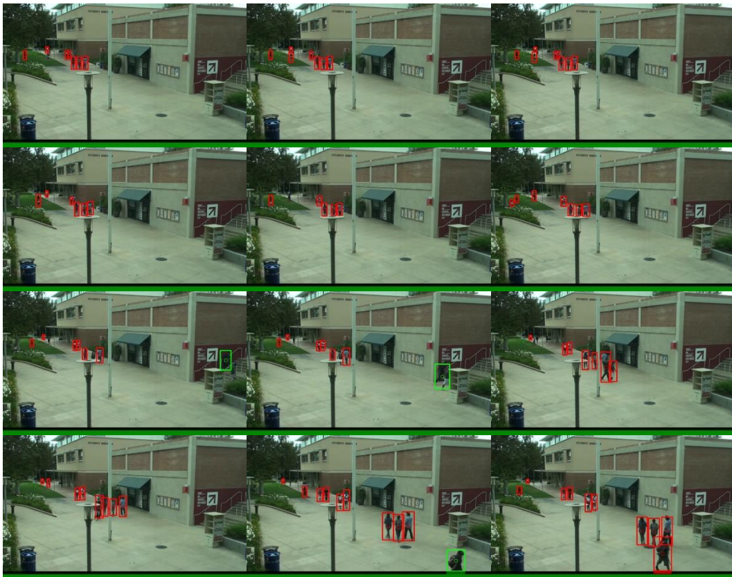
Figure 3. Frames of Virat video

The system is modeled using python, the code is taken from [19] and modified by using YOLO4 instead of YOLO3, the code is tested using Virat video dataset [20] and EPFL video dataset [21], to ensure if it can work well using online camera with different distances position of camera, the proposed system has worked well, and shows very satisfy results in online persons detection and social distance detection as shown in figures 3 and 4 below: