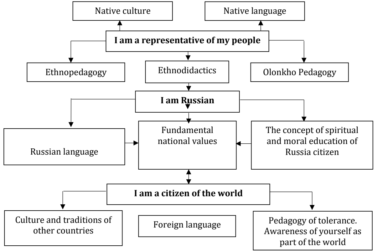
FIGURE 3. Ethnocultural education model

The ethnocultural education model is shown in the following figure (Figure 3):