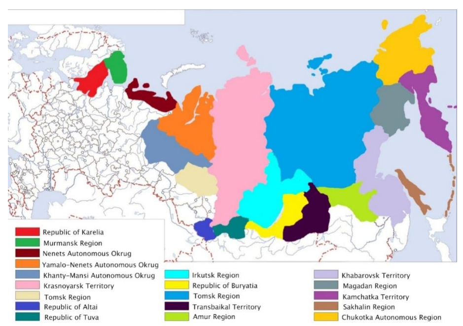
FIGURE 1. Map of North-Eastern regions of Russia

The study was conducted in 2018. It was held on the basis of the municipal budgetary preschool educational institution Child Development Center – Kindergarten No. 3 "Katyusha" in Yakutsk, the Republic of Sakha. The study covered 229 children of preschool age (4 senior groups and 4 school preparation groups): one parent of each of the children was interviewed. To determine the globality of the problem of the ethnocultural education of children, their parents were asked: "What language do you speak at home?" With the assistance of the educators of the research groups, the survey was conducted in person or by telephone.