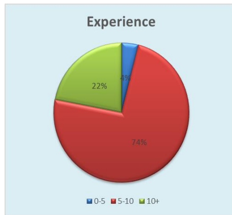
Figure 1: Experience of Participants