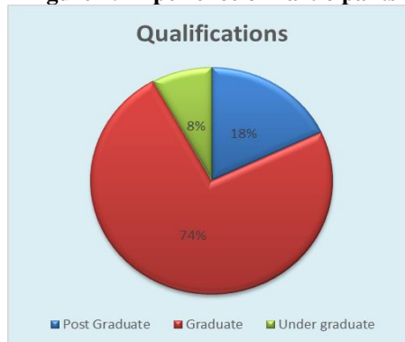
Figure 2: Qualifications of the participants