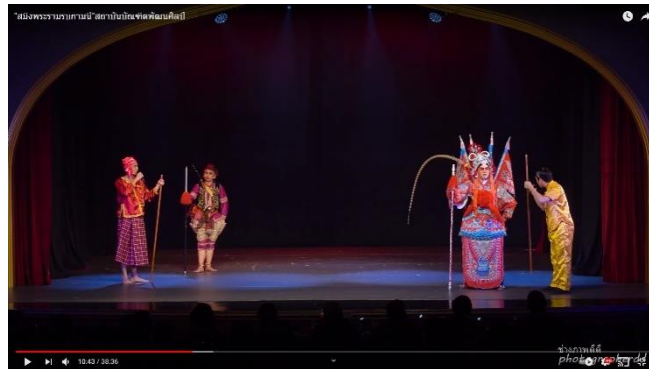
Fig. 7 Lakorn Pantang: Thai Classical Dance Drama in Mon and Chinese by Kromsilpakorn. [9]