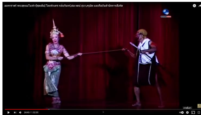
Fig. 3 Lakorn Chatree: Thai Classical Dance Dramaby Kromsilpakorn.[5]