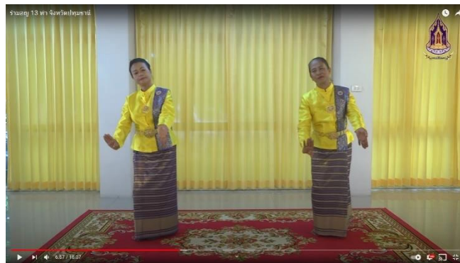
Fig. 12 Ram Mon (Mon Dance) by Mon in Pathumtani Province, Thailand. [14]