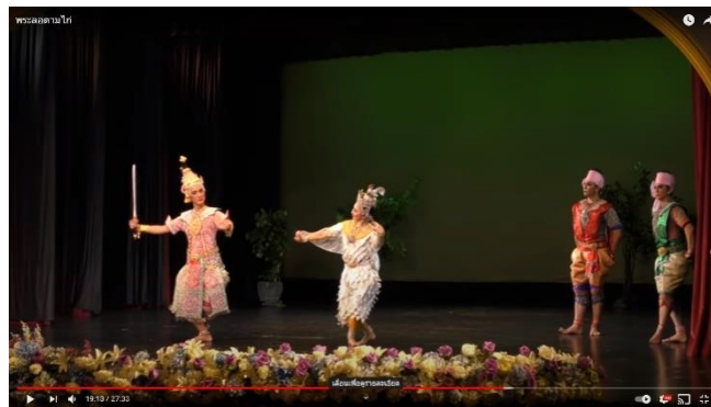
Fig. 11 Lakorn Pantang: Thai Classical Dance Lao by Kromsilpakorn. [13]