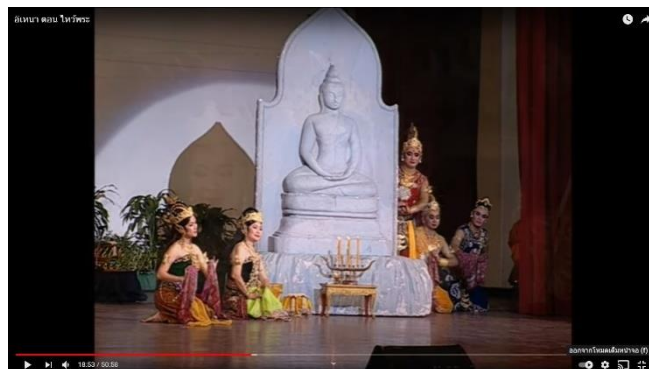
Fig. 9 Lakorn: Thai Classical Dance Drama in Java by Kromsilpakorn. [11]