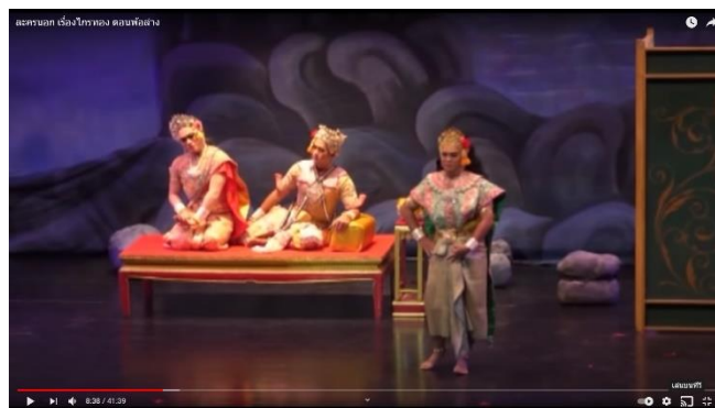
Fig. 4 Lakorn Nok: Thai Classical Dance Drama by Kromsilpakorn. [6]