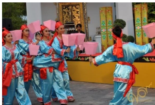
Fig. 13 YonRam Katang (Vietnamese Lighting Dance): Thai Classical Dance by Kromsilpakorn. [15]