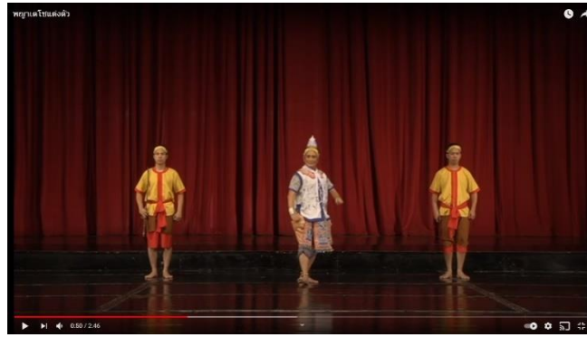
Fig. 10 Lakorn Pantang: Thai Classical Dance Drama in Khmer by Kromsilpakorn. [12]