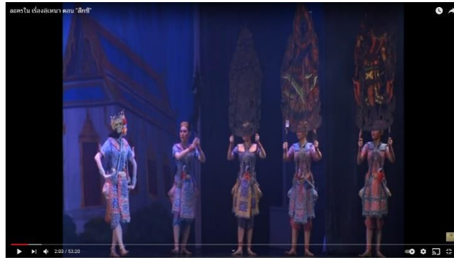
Fig. 6 Lakorn Nai: Thai Classical Dance Dramaby Kromsilpakorn. [8]