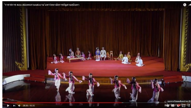
Fig. 8 Lakorn Pantang: Thai Classical Dance Drama in Mon and Bermese by Suan Sunandha Rajabhat University. [10]