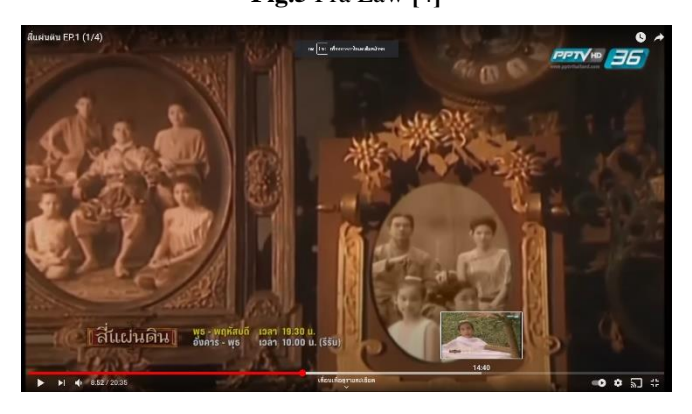
Fig.6 Si Pan Din [5]