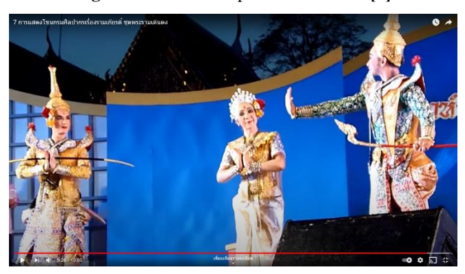
Fig.4 Ramakien: Praram Duen Dong [3]