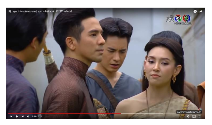
Fig.7 Bubpaesanniwas [6]