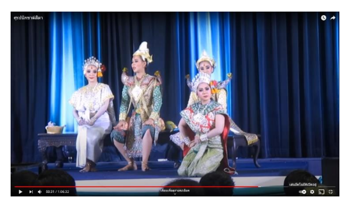
Fig.3 Ramakien: Surapanakka tee Seda [2]