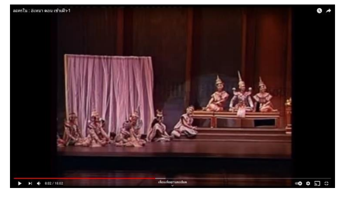
Fig.2 Lakhon Nai Inao [1]