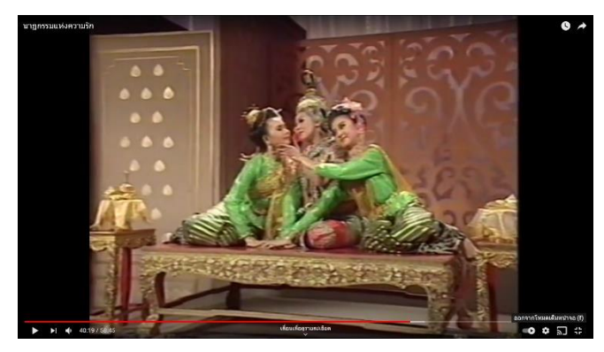
Fig.5 Pra Law [4]