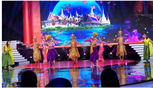
Fig 11. CultureExchang[10]