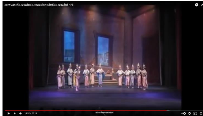
Fig 8. Lakhon Nok: Nang Sibsong [7]