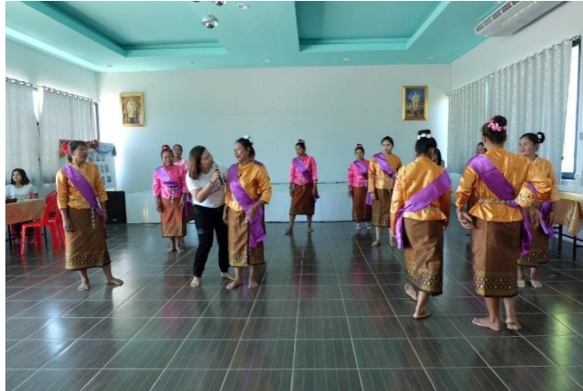
Fig 3. Innovative Movement Project (Nawattawithe) [2]