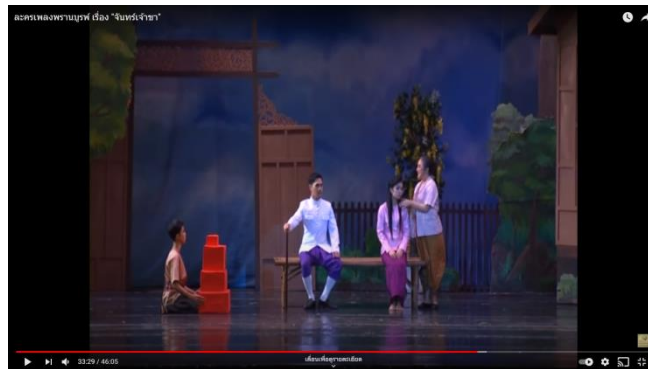
Fig 9. Musical drama: Chan Chao Kha by Phranbun [8]