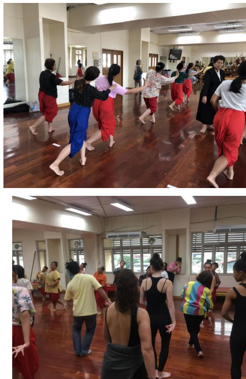
Fig 2. Thai Dancing Art for Community Project [1]

The role of Thai Classical Dances Program of Suan Sunandha is corresponded to the educational policy of Rajabhat University, especially the knowledge creation and development, as well as dissemination of knowledge to the community through various projects, such as Thai Dancing Art for Community, Nawattawithee, and course activities, which is also in conjunction with the preservation of art and culture.