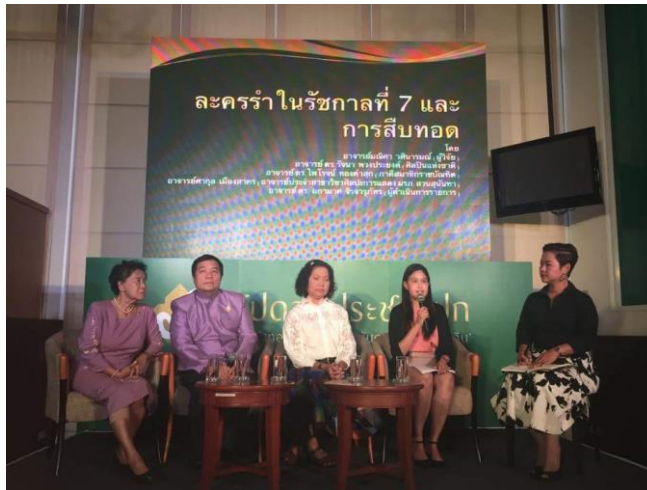
Fig 4. Presentation of research project [3]