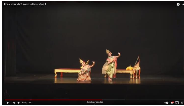
Fig 7 Creative work: Maya Rasmi and Sakara Wati Dress Up [6]