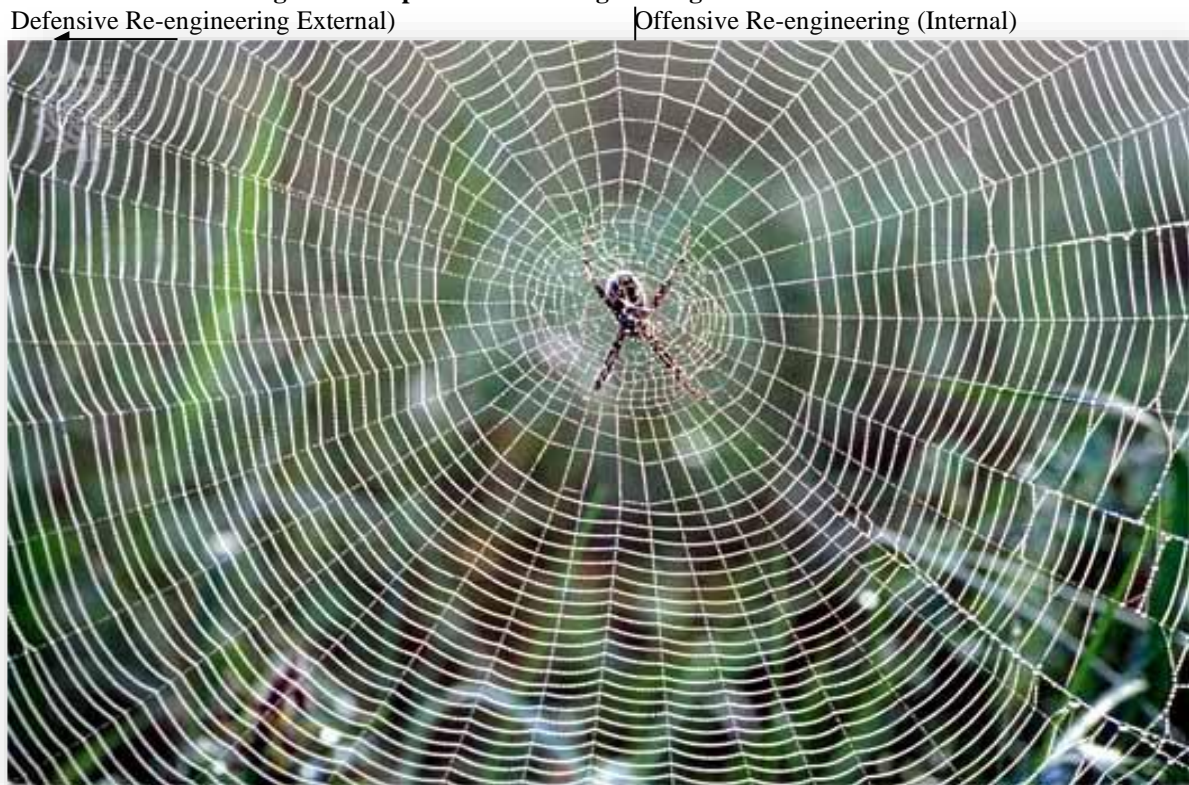
Figure 1: A Spider Web Re-engineering Framework

revamp agrarian SMEs using a twin pronged re-engineering methodology, so that they improve their internal and external environments and are able to increase their performance and realise their radical development (Durendez, Ruiz-Palomo, Garcia-Perez-de-Lema & Dieguez-Soto, 2016). It is against this background that SME re-engineering involves rigorous structural transformation in order for them to improve work flow systems and be productive. The conceptual framework is indicated in Figure 1 below presenting how the main variables are related (Dzinotizei, 2019).