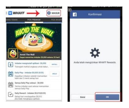
Figure 1. Whaff interface