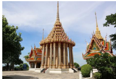
Fig.3 Landmarks of Wat khao phra si sanphetchayaram