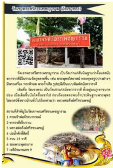
Fig.4 Example of information in the innovation