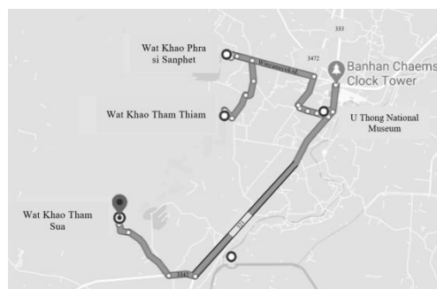
Fig.2 Examples of historical tourist routesmap

1) Created routes guide can be divided into 3 groups. Each group consists of a navigator map, pictures of landmarks of tourist attractions, important of tourist attractions, QR code showed history of attractions, Opening and closing time, etc. Example of innovation details were shown in Fig. 2-5