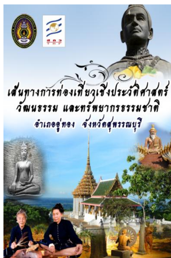
Fig.5 Cover of innovation

2) The research found appropriateness of routes guide innovation by the expects. has shown in table 1.