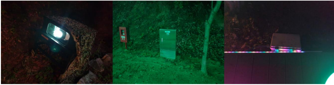
Figure 8. camouflage projector cover and exposed control box

Projector housings installed in Korea use shielded enclosures with only cooling fans as shown in Figure 8. The outer cover also uses camouflage lights or comes out of nature in a heterogeneous color. Figure 9 shows the external projector enclosures currently on the market. Coolers, heaters, and humidity control functions and materials in front projector windows have similar functions. Unfortunately, according to the case study, when artificial elements were added to the natural environment, there were no forms designed to match nature. The overseas cases were rather open without cover, and there were many types of housing that emphasized stability and efficiency in the country where the weather and the four seasons were easily changed, but only traces of military camouflage were seen trying to blend in harmony with nature. These areas remain the parts that can easily improve the quality of the content experience if designed and constructed with a little more detail.