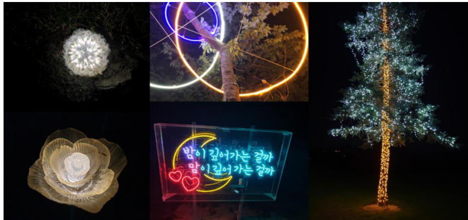
Figure 6. Outdoor lighting fixture design of Vivaldi Forest and Sonata of Light

interactive operation that usually induces the installation of an app using a QR code, or displays face pictures and phrases (name, wish, prayer, etc.) on a large display using an app or web page installed at the time of first entry, and induces the user to take a picture of the screen again. The third is a tread plate-type light that changes when stepped on, similar to the touchball we have seen earlier. It is manufactured using touch, weight, and pressure sensor, and when the user steps on it, it is detected through the sensor and the lighting value installed inside changes. It is relatively simple interactive, but it is easy to draw users' actions, and it is a good interactive element to create a movement line, so it does not fall into the night forest park theme park.