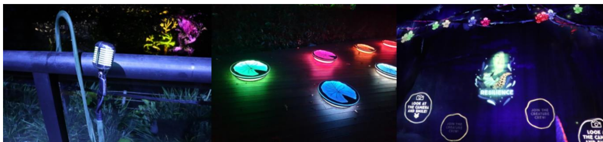
Figure 2. Outdoor interactive special effects

Figure 1 is the existing special stage effect technology used in outdoor space and is a hologram screen, laser effect, and projection mapping technology in order. These technologies were made using existing indoor equipment as outdoor equipment, and all of them were used as outdoor equipment except for projectors. Advantages of existing special stage effects are applied to outdoor space, which indicates high effect. The hologram screen is divided into rear and front. Two methods are used depending on the location and effect of the installation, divided by the user's point of view and the presence of the background. The laser effect is a very difficult method in outdoor space. If you want to see laser light with your eyes, you need to use a fog machine and a haze machine together, but it is difficult to maintain a certain amount because the wind and temperature change in the outer space. In the case of projection mapping, it can be divided into forest parks by projecting into natural objects. The existing methods of LED media facade (LMF) and projection media facade (PMF) are upper-level concepts[7], and the actual production method and projection method are determined according to the type of artifacts and natural objects. Rainforest Lumina was projected onto a natural-looking artificial stream that was formerly a zoo cage. The audience will see the zoo's cage in a visible form.