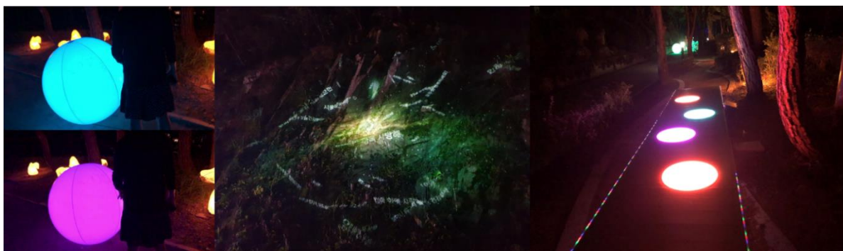
Figure 5. Outdoor interactive special effects of Vivaldi Forest and Sonata of Light

Figure 5 shows touch balls using the interactive technology of the night forest park, text plotting using a mobile phone, and circular lighting that changes when stepped on. Rather than the interactive installation contents of the moment factory that we looked at earlier, domestic interactive installation showed many simple and plain forms. Because this content is installed outdoors, it is somewhat disappointing because there are many things that focus on durability and maintenance. The first is a one-dimensional interaction light in which the light changes when the ball is touched with a touch ball. It is simple, but that is why it has an interactive structure that is easily accessible to the general people. The second is the interactive installation, in which the text you enter appears on the screen projected by your projector and disappears after being rich. It is an