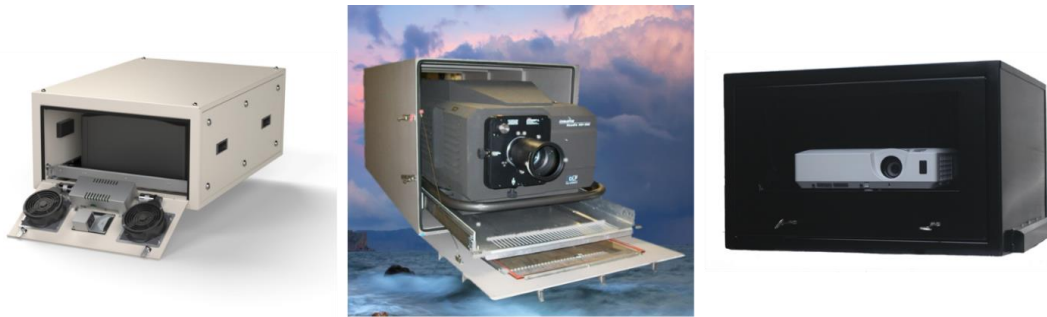
Figure 9. TEMPEST's small & large enclosures and ProEnc's Outdoor Enclosure[10,11]

Projector housings installed in Korea use shielded enclosures with only cooling fans as shown in Figure 8. The outer cover also uses camouflage lights or comes out of nature in a heterogeneous color. Figure 9 shows the external projector enclosures currently on the market. Coolers, heaters, and humidity control functions and materials in front projector windows have similar functions. Unfortunately, according to the case study, when artificial elements were added to the natural environment, there were no forms designed to match nature. The overseas cases were rather open without cover, and there were many types of housing that emphasized stability and efficiency in the country where the weather and the four seasons were easily changed, but only traces of military camouflage were seen trying to blend in harmony with nature. These areas remain the parts that can easily improve the quality of the content experience if designed and constructed with a little more detail.