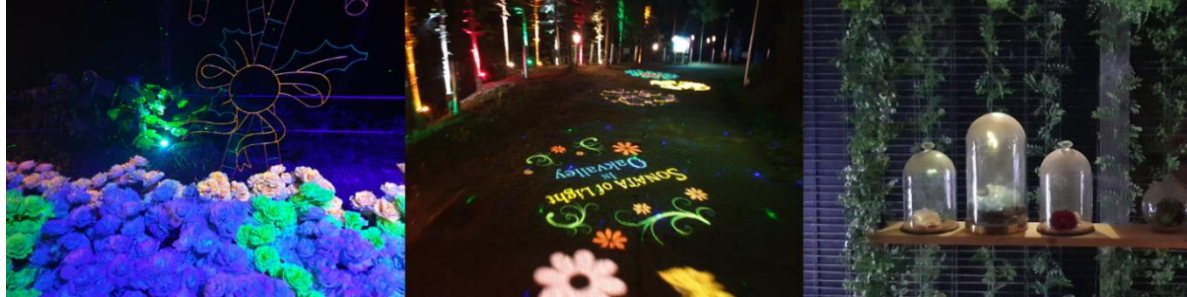
Figure 4. Outdoor use cases for special stage lighting of Sonata of Light