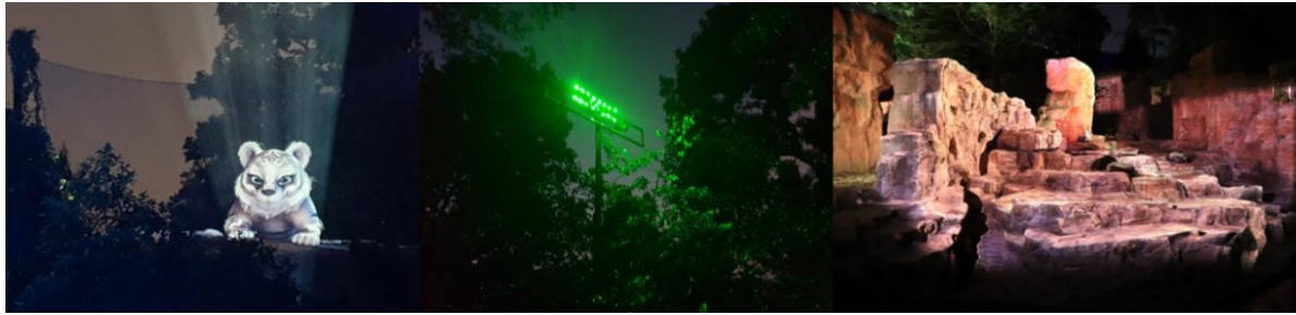
Figure 1. Outdoor use cases for special stage lighting

Figure 1 is the existing special stage effect technology used in outdoor space and is a hologram screen, laser effect, and projection mapping technology in order. These technologies were made using existing indoor equipment as outdoor equipment, and all of them were used as outdoor equipment except for projectors. Advantages of existing special stage effects are applied to outdoor space, which indicates high effect. The hologram screen is divided into rear and front. Two methods are used depending on the location and effect of the installation, divided by the user's point of view and the presence of the background. The laser effect is a very difficult method in outdoor space. If you want to see laser light with your eyes, you need to use a fog machine and a haze machine together, but it is difficult to maintain a certain amount because the wind and temperature change in the outer space. In the case of projection mapping, it can be divided into forest parks by projecting into natural objects. The existing methods of LED media facade (LMF) and projection media facade (PMF) are upper-level concepts[7], and the actual production method and projection method are determined according to the type of artifacts and natural objects. Rainforest Lumina was projected onto a natural-looking artificial stream that was formerly a zoo cage. The audience will see the zoo's cage in a visible form.