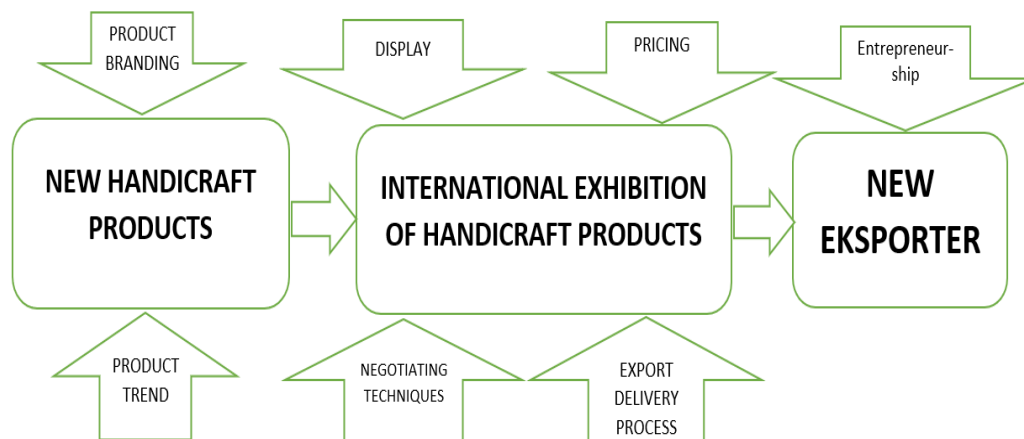
Figure 2. The new Export flow starts from the manufacture of products and the International Exhibition of Handicraft Products and its completeness instruments

Experts, in this case, draw from exporters and instructors who are experienced in the handicraft business world. The workshop needed experts as an important part of an innovative mechanism to create a vocational education system (Овчинников, 2019). Exporters are members of the Indonesian Trade Industry Association (ASMINDO). ASMINDO is a furniture and craft association that develops product designs, prices, and human resources for artisans and designers (Ciptagustia & Kusnendi, 2019). Program material is prepared from the start related to the company's upstream-downstream preparation process in carrying out export work. So that MSMEs prioritized in this training can be independent with assistance for two years. The new export flow starts from the manufacture of products and the International Handicraft Exhibition. The completeness of the instruments can be seen in Figure 2.