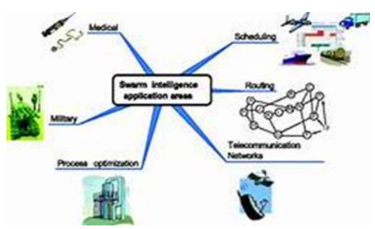
Figure 1. Applications of Swarm Intelligence

These properties of SI allow the swarm to address complex problems that require the individual agents to work together collectively. The developments of the SI algorithms have attracted the researchers in the recent years for its characteristics. Some of the SI algorithms are Particle Swarm Optimization, Artificial Bee Colony Optimization, Ant Colony Optimization, Cuckoo Search Algorithm, Glowworm Swarm Optimization[4]. These different kinds of optimization algorithms have been practically applied for various optimization problems [15], [17]. Figure 1 shows some of the applications of Swarm Intelligence