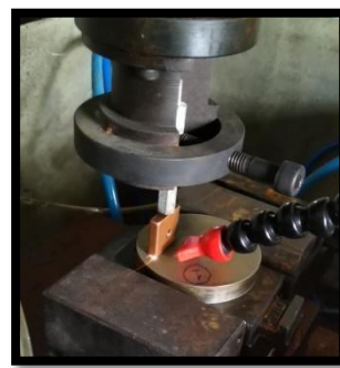
Fig. 4: Machined Workpiece Fig. 5: Machining