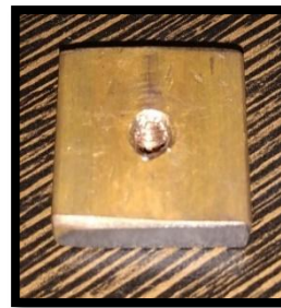
Fig. 3: Tool