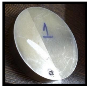
Fig. 2: Workpiece

Dimension of work piece was 60mm in diameter and 10mm in thickness. The electrode used was of copper of dimension 20mm*20mm*5mm.