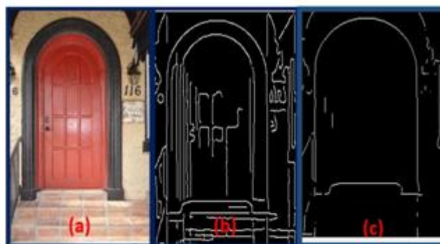
Figure 2: Image after detecting edges: a) Original Image b) Edge Detected by Canny Edge Detector c) Edge Detected by Prewitt Edge Detector

We observe that in case of simple image for detecting edges, prewitt edge detection algorithm works better than the other edge detection algorithms. The benefits of the Prewitt operator include fast processing speed, relatively smooth and continuous edges. For this, we are using prewitt edge detection algorithm for detecting edges in our proposed method. The primary advantage of prewitt operator is simple approximation of the gradient magnitude. The second advantage of the prewitt operator is detecting edges and their orientations are simple [17]. We also found out that in our proposed method, the required processing time for edge detection and then preserve the desired edges by prewitt edge detector are better than that of canny edge detector. In Figure 2, we show that prewitt edge detector preserve the desired door structure better than that of canny edge detector.