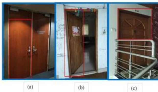
Figure 6: Challenging door detection: a) differently illuminated door b) partially opened door c) door not visible properly

In our proposed method, some difficulties emerge in detecting the door as presented in Figure 6. The door is not correctly identified when the quantity of light changes abruptly in images as shown in 6(a). The door is not correctly detected when the door is partly opened 6(b). Door detection is not performed properly when the door is not clearly visible 6(c).