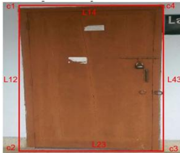
Figure 4: A Doorframe

In our proposed system, corners and edges are extracted first. A doorframe has four corners and four door lines, which are perpendicular to each other in ideal condition. Both horizontal doorframe lines are nearly parallel to the image's horizontal axis. Vertical lines of the doorframe should be perpendicular to the image's horizontal axis. An ideal door should have certain width and length. In our proposed system to detect a door in an image we considered the above mentioned general concept about the door.