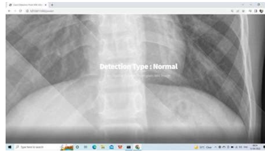
Fig4: Result Of Prediction