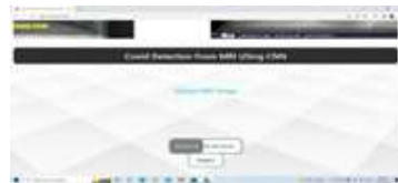
Fig1: Button to Upload MRI Image