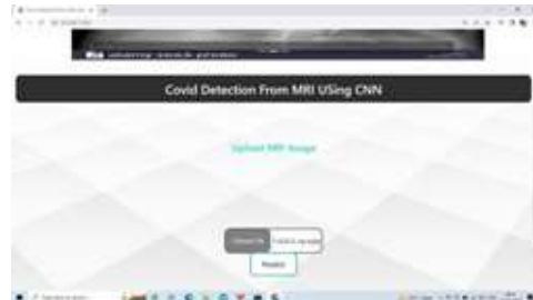
Fig2: Button To Predict Image