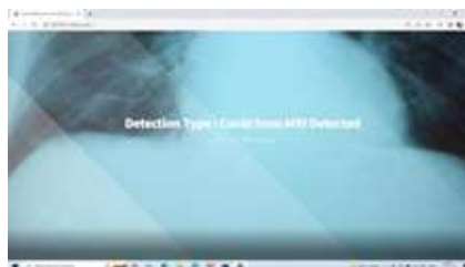
Fig3: Result Of Prediction