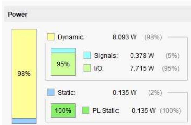
Figure 4: Proposed Power Result.