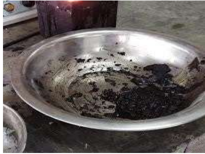
Fig.2: Sodium lignosulfonate mixed with kerosene

Sodium lignosulfonates are employed as an addition in the current investigation. Organic liquids were added to the mixture to increase the sodium lignosulfonates' compatibility with asphalt. Kerosene and creosote both worked well to spread sodium lignosulfonates more evenly throughout the asphalt.