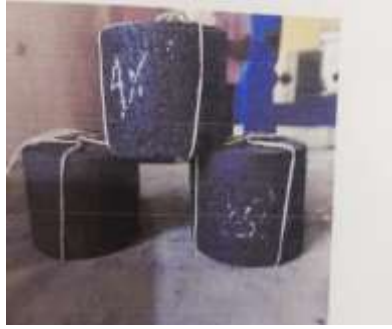
Fig.6- Marshall Sample