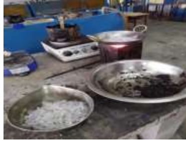
Fig.3- Preparation of Lignin and Waste Plastic mixed aggregate