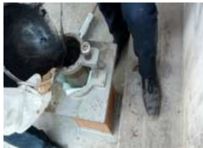
Fig.5:- Marshall Sampling mold