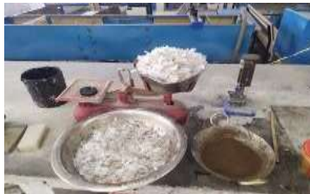
Fig.2- Shredded Waste Plastic

In the current investigation, stabilising additives include polypropylene, low density polyethylene, high density polyethylene, and polypropylene. The used plastics were gathered, then washed and cleaned by soaking them in hot water for two to three hours. Then they were dried.