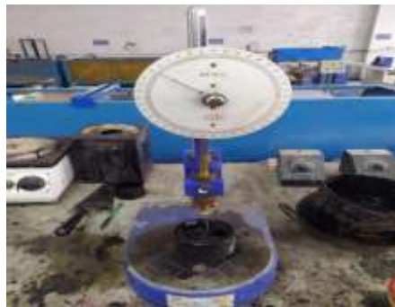
Fig.4- penetration test

Bitumen is softened at a pouring consistency between 800C and 1100C for the penetration test. To make the sample material uniform and free of air bubbles, it is thoroughly mixed. The containers are then filled with the sample material and let to cool in the environment for one hour. It is then submerged for 60 minutes at a temperature of 250C in a temperature-controlled water bath. Under the proper loading, a conventional needle is permitted to pierce the surface for 5 seconds. This is accomplished with a penetrometer, a device. IS: 1203-1978 has standardised this test.