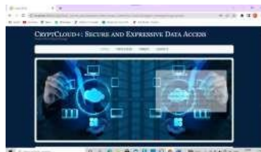
Fig 4: Data user's home page after login of data user