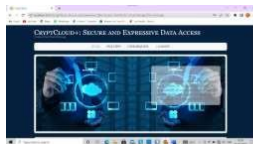
Fig 8: STA's home page after login of STA