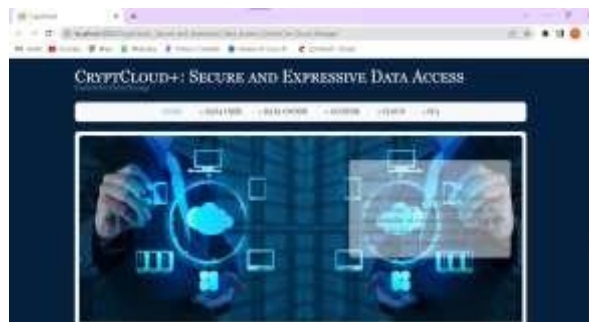
Fig 2: Home Page of Crypt cloud