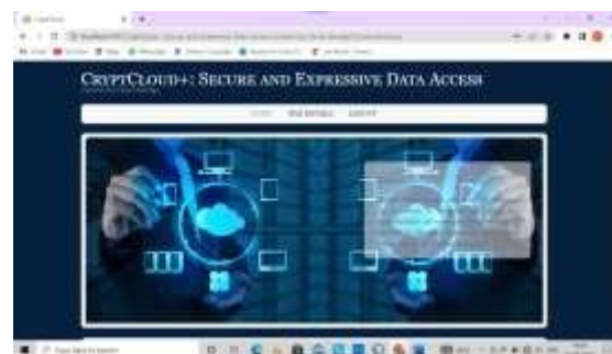
Fig 7: Cloud's home page after login of cloud