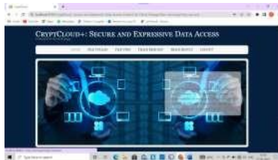
Fig 5: Data owner's home page after login of data owner