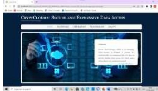
Fig 6: Auditor's home page after login of auditor