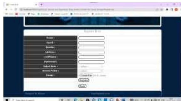
Fig 3: Showing the data user's registration page