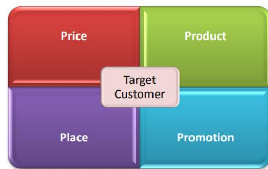
Figure 1: The relation between customer and the main elements of MM

Promotion helps the trader and sales force to show the product to the customers in an effective manner and encourage them to purchase. Promotion depends on many mixtures of its components which are used to realize the organization's marketing objectives. Advertising is a strong element of promotion mix (Singh, 2012). The main purpose of the advertising is to make and evolve the image of a product in the market zone. It is one of the significant tools of competition which saves the dynamism of industry. Promotion mix determines the positioning of the product in the target market. It should be considered as an expense and hence added to the cost of a product (Borden & Marshall, 1959). Figure 1 illustrates the main elements of MM and their relationship with the customer.