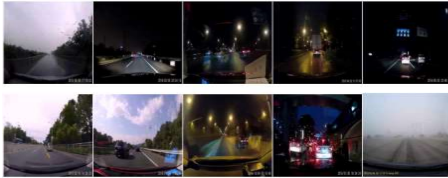
Figure 2 Sub-sample of 10 categories traffic road scene (from left to right, from top to bottom, the labels are 1-10)