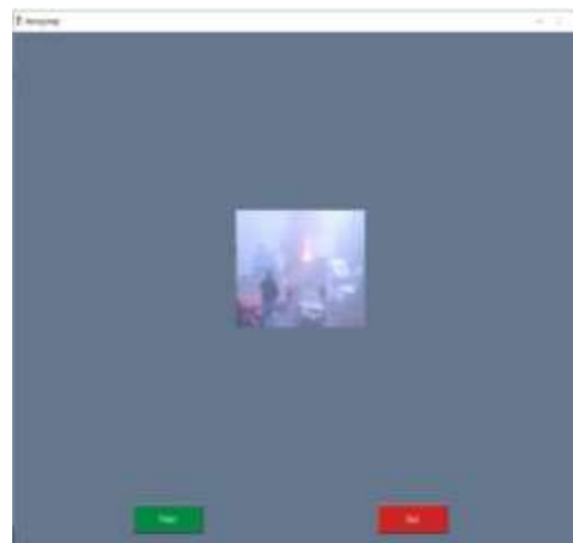
(b) Detection of traffic.