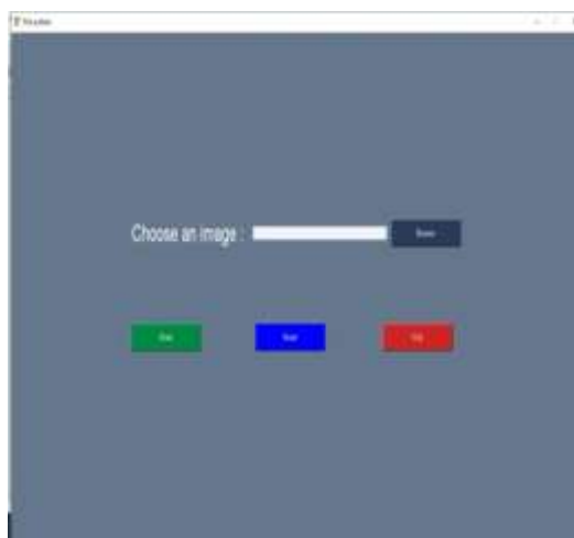
(a) Upload test image.