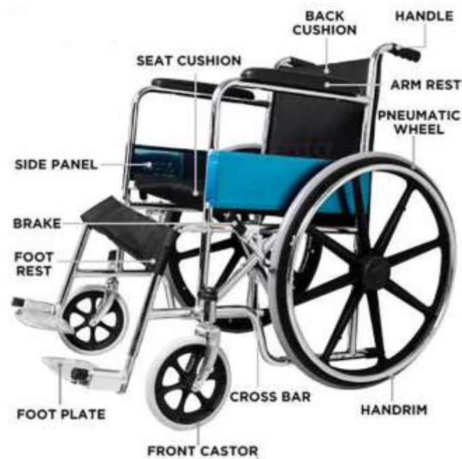
Figure 1: Sample wheelchair of Entros 809B SC.

independence to individuals with physical disabilities, empowering them to navigate their surroundings with ease and confidence.