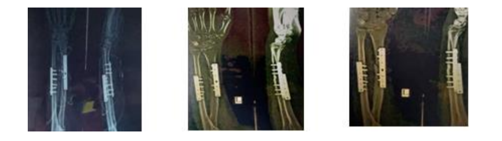
Patient 1: Post-op, 6 weeks and 12 weeks x-rays