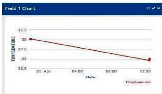
Figure3.3 LiveData ofSoilMoisturewithDateandTimefromThingspeak.com