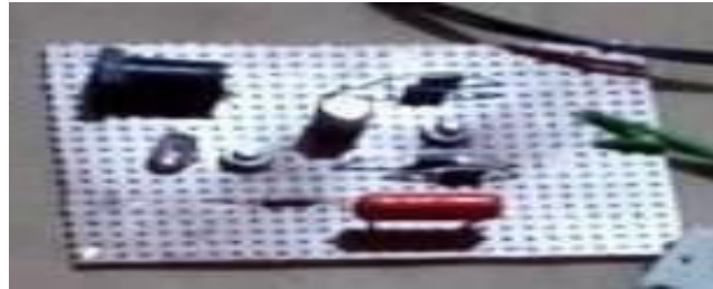
Figure2.6 Battery charging circuit