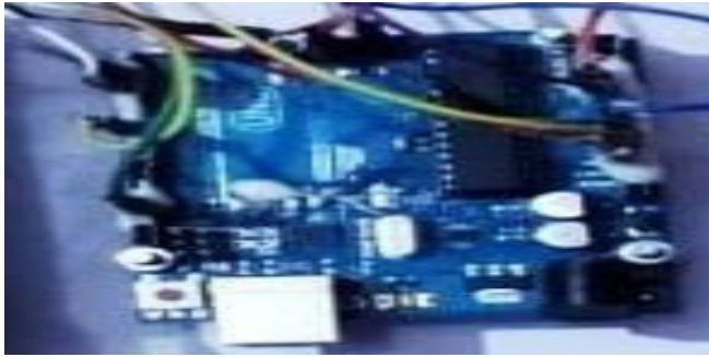
Figure2.1 ARDUINO UNO