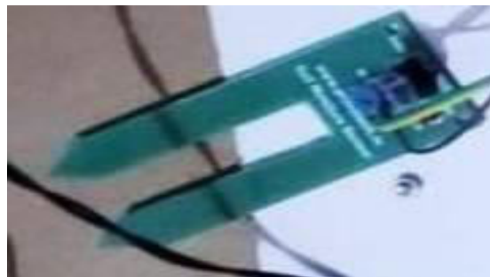
Figure 2.4 SOIL MOISTURE SENSOR-FC28

Soil Moisture Sensor is used for measuring the moisture in soil and similar materials. The sensor has two large exposed pads which function as probes for the sensor, together acting as a variable resistor. The moisture level of the soil is detected by this sensor. When the water level is low in the soil, the analog voltage will be low and this analog voltage keeps increasing as the conductivity between the electrodes in the soil changes. This sensor can be used for watering a flower plant or any other plants that require automation.