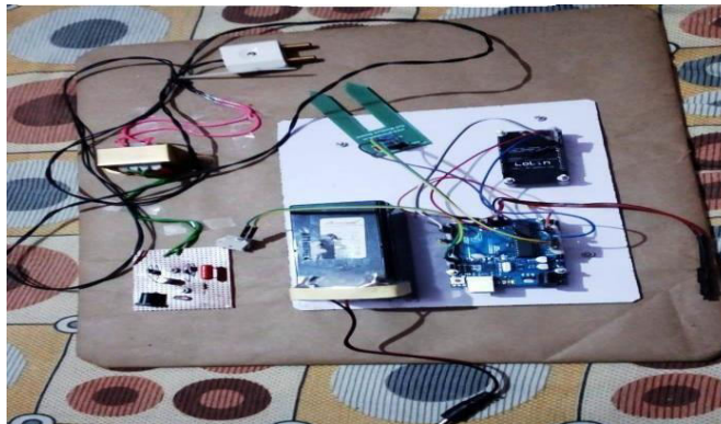
Figure 2.9 Overall circuit design

In this circuit there is a programmed ARDUINO which is connected with sensors (soil moisture and temperature) and a wifi module. The working principle of the model is based on storing data from the sensors with the help of ARDUINO and passing it to the wifi module. The wifi module gives the updates of data in a device through cloud computing. In the device, the real-time data comes through wifi to the channel named SMART FARMING which we can access through the URL : https://thingspeaks.com/channels/625454 . In the channel, the graph is plotted through matlab technology. There is a chargeable battery which is connected with the power supply of ARDUINO so that the circuit starts working. There is also a charging circuit with an AC/DC converter for charging the battery. In the case if the battery is not charged, there is further an adaptor which can explicitly give power to ARDUINO circuits.