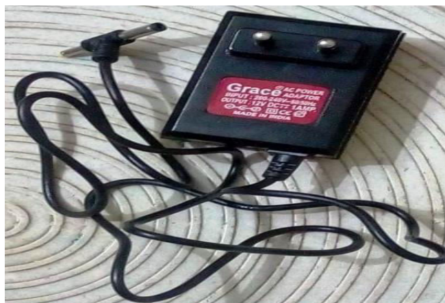
Figure2.8 External AC Adapter

A 12V AC adapter can also be considered as a component in the circuit for external power supply for the circuit which enabled the circuit to be switched 'ON' in case if the battery power is very low for use. The adapter can directly act as an AC/DC converter to provide pure DC current externally to the circuit.