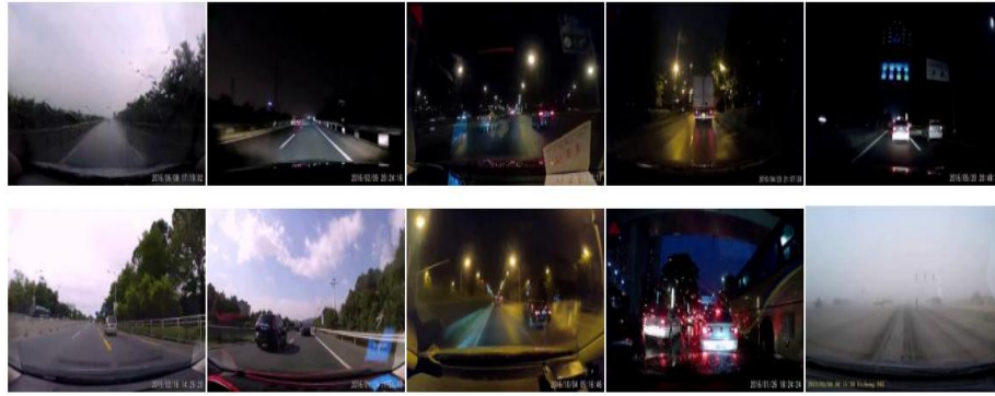
Figure2 Sub-sample of 10 categories traffic road scene (from left to right, from top to bottom, the labels are 1-10)